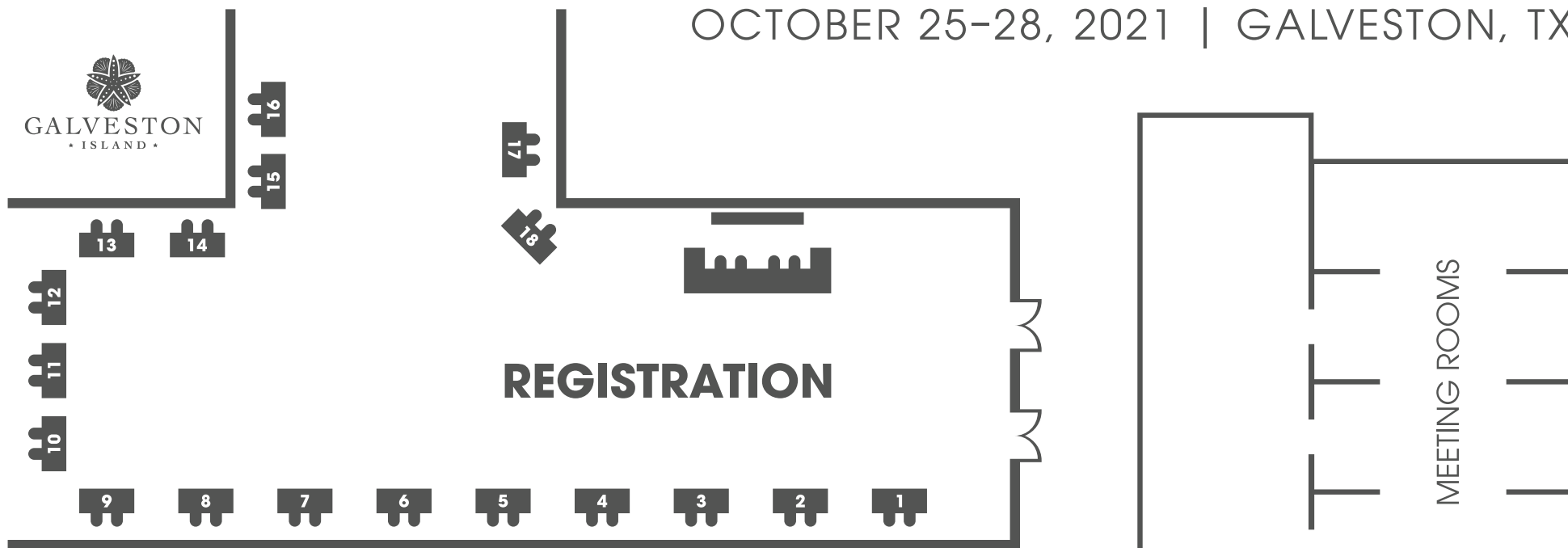
detail of exhibition area